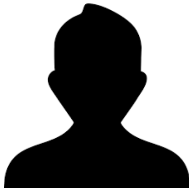
NO PHOTO PROVIDED