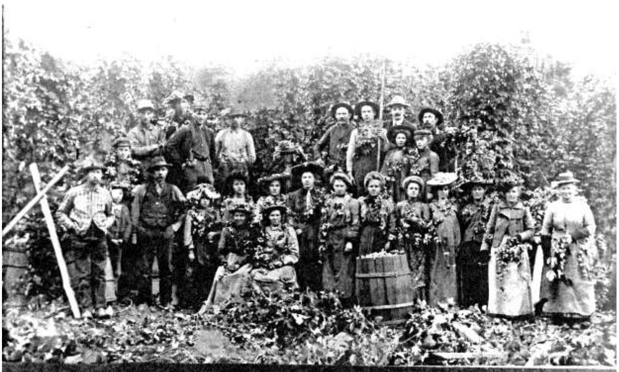
Hops Harvest Celebration